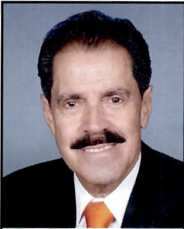
Rep. Jose Serrano (D-NY) 12-term Congressman