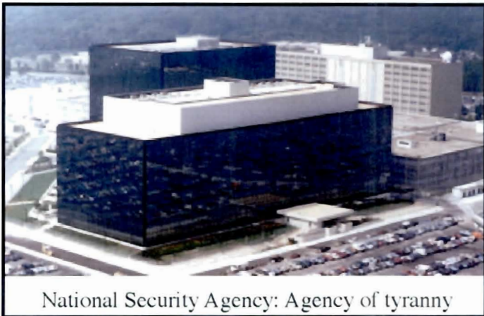
National Security Agency: Agency of tyranny

Edward Snowden, former government contractor in May 2013 leaked secret U.S. documents exposing the governments secret spying program to warn Americans that Washington was secretly putting together the pieces to form an all-powerful, oppressive government that could be activated at the whim of those in power.